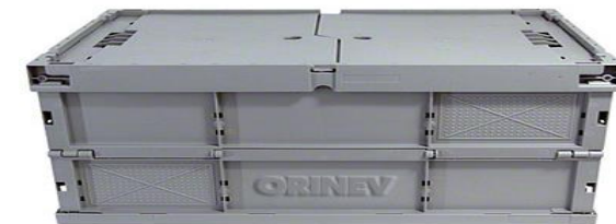
Fig. 5 Containers and crates of plastics