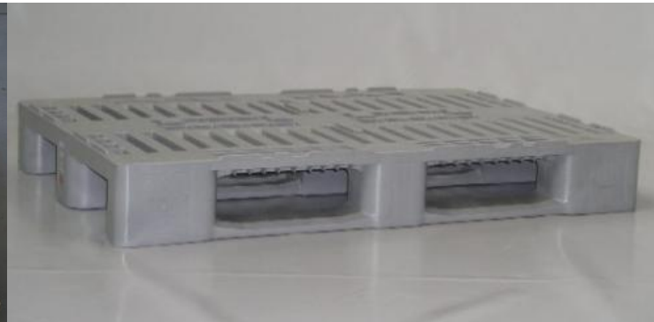
Fig. 4. Euro pallets of plastic 1200x800x160 mm.