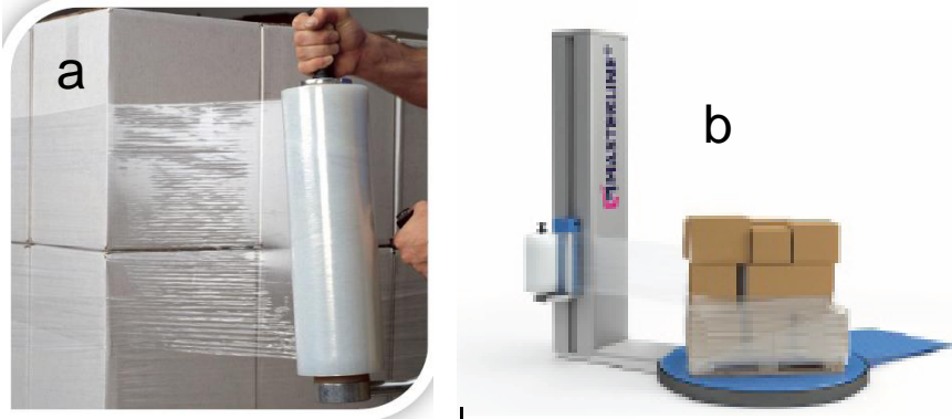
Fig 2 Manual stretch film (a) ( http://luckapack.ro ) and automatic(b) www.antal.ro

Containers connected to one another with plastic tape are becoming more popular for compression-resistant products.