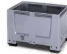
Plastic box 535L with 4 legs