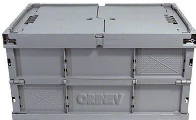
Folding box with lid

With these folding boxes, it can save storage capacity up to 82 % when boxes are empty. The integrated lid protects the goods from dust and prevents alteration. http://magazin.orinev.ro