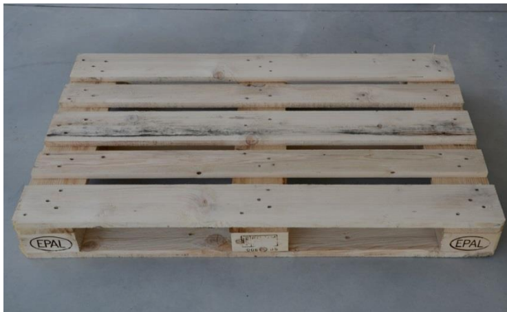
Fig. 3. Euro wood pallets certified EPAL (UIC-leaflet 435-2), heat treated according to IPPC/ISPM 15, Size: 1200x800x145 mm - http://www.europalbox.ro